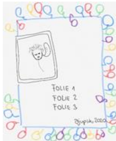
Fig. 2 - Classical presentation in an online setting with slide 1, slide 2, slide 3, ...